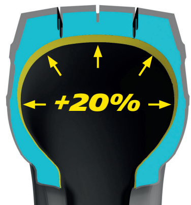
MICHELIN® X-STRADDLE® 2 450/95 R 25 MICHELIN® X-STRADDLE® 2 480/95 R 25

The MICHELIN® X-STRADDLE® 2 480/95 R 25 tire has +20% more air volume than MICHELIN® X-STRADDLE® 2 450/95 R 25